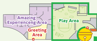
Park Zone Entire Map

Let's push back the Doraemon and Dorayaki falling from above with your hands, as not to drop them.