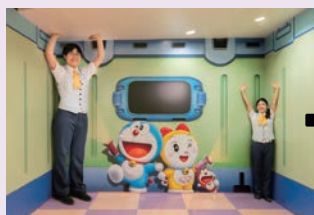
Magnify Ray / Shrink Ray