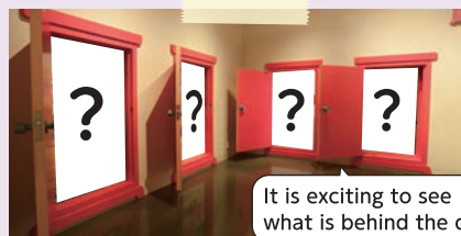
A room with everywhere full of Anywhere Doors